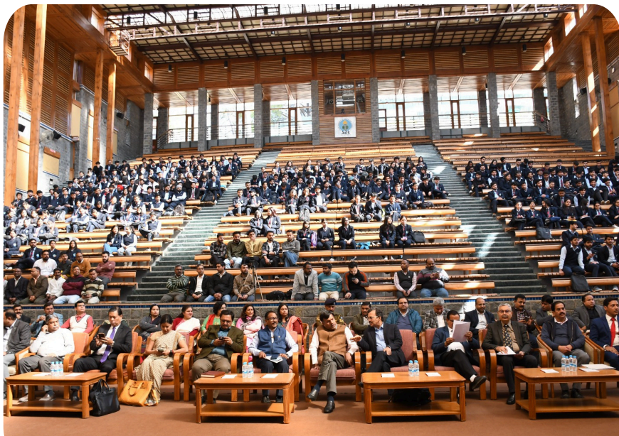
SUSTAINABILITY CONCLAVE AT JAYPEE UNIVERSITY OF INFORMATION TECHNOLOGY, WAKNAGHAT, HIMACHAL PRADESH ON 19TH MARCH, 2024