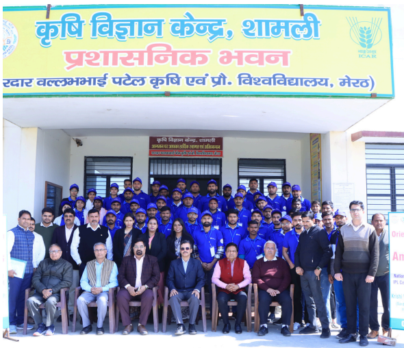
ORIENTATION PROGRAMME AT KVK SHAMLI, UTTAR PRADESH