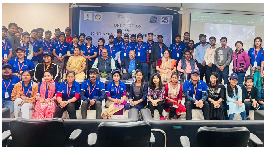
ORIENTATION PROGRAMME AT FAKIR MOHAN UNIVERSITY, BALASORE, ODISHA