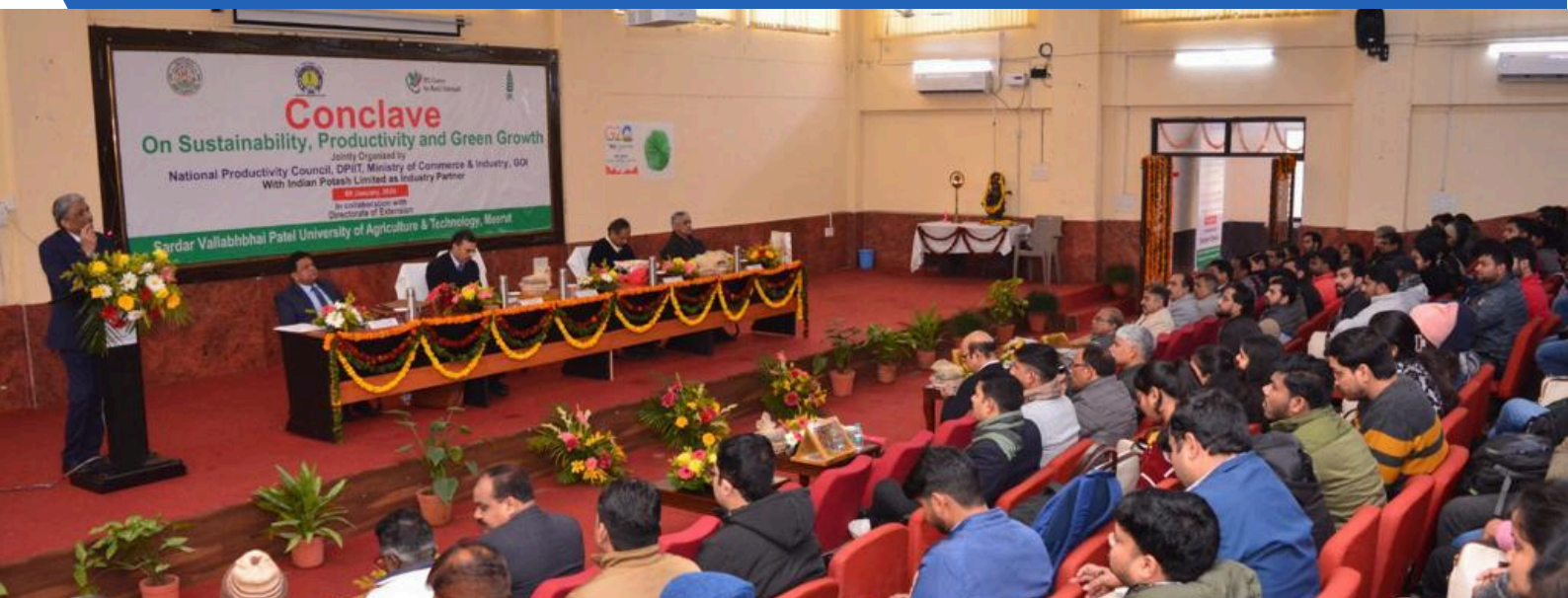
SUSTAINABILITY CONCLAVE AT SARDAR VALLABHBHAI PATEL UNIVERSITY OF AGRICULTURE & TECHNOLOGY, MEERUT, UTTAR PRADESH ON 9TH JANUARY, 2024