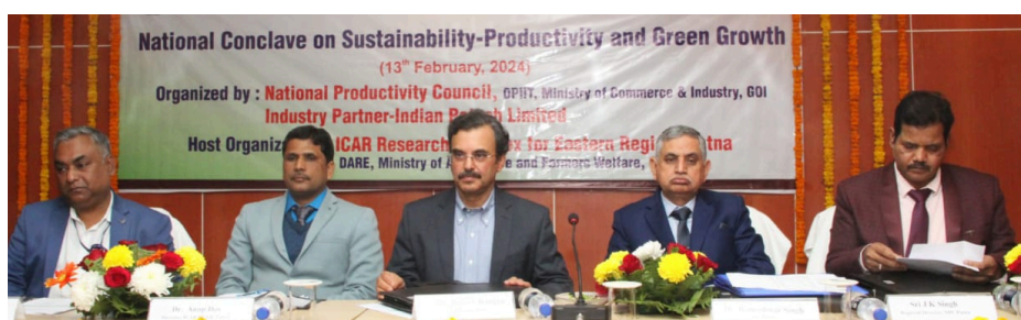
SUSTAINABILITY CONCLAVE AT ICAR, PATNA ON 13TH FEBRUARY, 2024

Sustainability is an integral part of the CSR policy of Indian Potash Limited indicating the company's intention to make a positive contribution to the society in which the company operates. Ensuring environmental sustainability, ecological balance, protection of flora and fauna, agroforestry, conservation of natural resources and maintaining quality of soil, air and water through CSR activities has been strived by IPL.