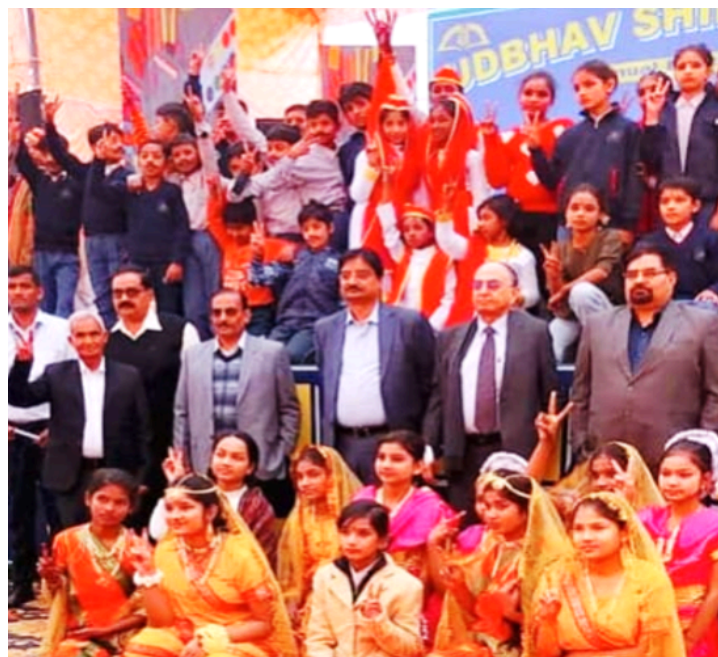
ANNUAL FUNCTION AT UDBHAV SHIKSHA NIKETAN, SAKHOTI TANDA