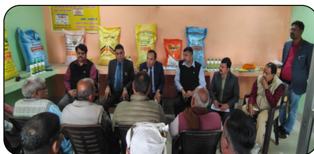
Interactive Session with the Farmers

The farmers in attendance were eager to learn about the positive impact of Gr MOP, and many expressed their commitment to adopting the product for all their crops going forward. The meeting concluded on a high note, with farmers leaving empowered and motivated to implement new practices that would enhance their farm income and productivity.