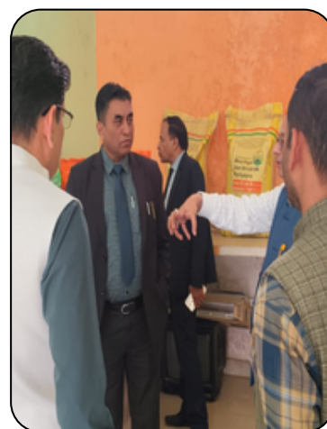
Snippets of the event

The seminar concluded with an exciting lucky draw, where several farmers received gifts, making the event both informative and engaging for all participants.