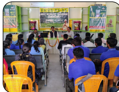
Glimpse of the Farmers Meet

The event also featured a Q&A session, where farmers and interns had their questions addressed. The meet concluded with refreshments and a vote of thanks. The session was a valuable opportunity for farmers to gain knowledge on sustainable farming practices and improve agricultural productivity.