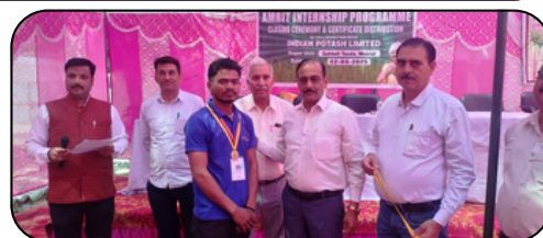
Interactive Session and Certificate Distribution Ceremony

The event concluded on a high note, celebrating the achievements of the interns and reinforcing IPL's mission to support the next generation of agricultural leaders.