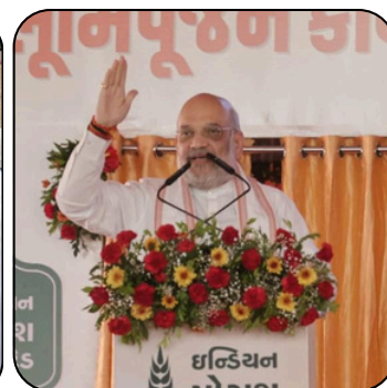
Chairman, IPL Welcoming Shri. Amit Shah ji

Indian Potash Limited (IPL) has taken a monumental step towards strengthening India's agricultural and cooperative sectors with the revival and modernization of three sugar mills located in Kodinar, Talala, and Valsad in Gujarat. The announcement was made by Union Home Minister and Minister of Cooperation Shri. Amit Shah at a foundation-laying event on March 8, 2025, in Kodinar, Gir Somnath district.