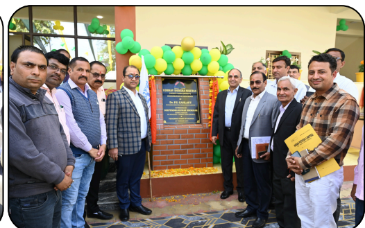
Snippets of the event

This momentous occasion is a testament to IPL's unwavering commitment to nurturing young minds and building a brighter future!