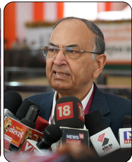
Shri. Amit Shah ji at the ceremony