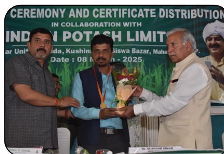
Glimpse of the event

The event concluded with the presentation of mementos, leaving attendees with a sense of achievement. The Amrit Internship Program reinforced IPL Foundation's commitment to skill development and agricultural research, paving the way for future initiatives.