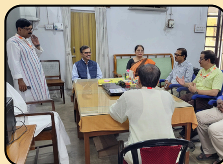
Glimpse of the Amrit Internship Orientation Programme