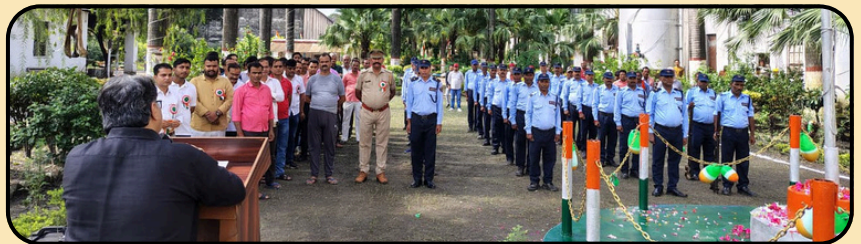
Snippets of the event

At IPL Foundation, we are committed to keeping you up-to-date with the latest news and developments across all areas of the organization. Our goal is to offer you a unique platform for accessing important information. We appreciate your ongoing support and encourage you to continue being a part of this journey.