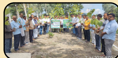
Glimpse of the Plantation drive held at IPL Sugar Unit, Khadda