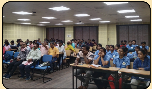
Snippets of the event

Interactive and technical sessions addressed soil health, water conservation, crop diversification, climate-resilient farming, and cooperative movements. The Valedictory Programme celebrated the interns' contributions, with certificates awarded for their impactful work. The programme concluded with a vote of thanks, underscoring the need for continued collaboration among academia, government, and farming communities to drive rural development and innovation in agriculture.