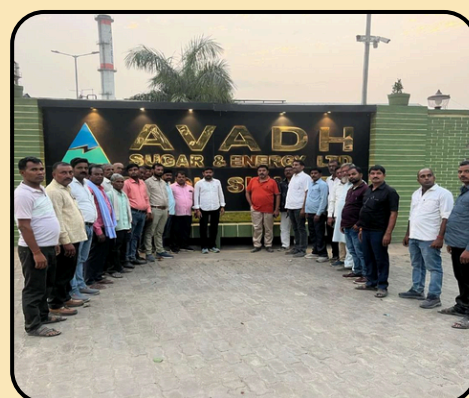
Discussions were held among the farmers