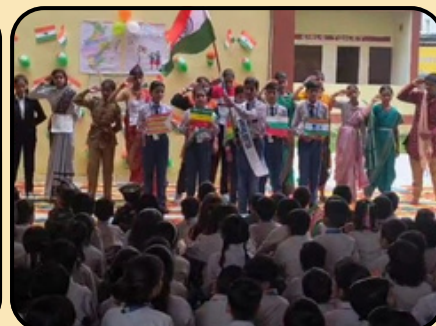
Celebration of 79 th Independence day

Students showcased their patriotism through soulful songs, energetic dances, inspiring speeches, and heartfelt poems. Various competitions, including a quiz, slogan writing, and drawing on the theme of freedom, engaged students in remembering the golden history of our struggle. The quiz tested knowledge while reinforcing the values of our nation.