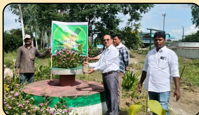
Active participation of the employees in plantation drive