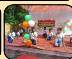
Student performances during the event