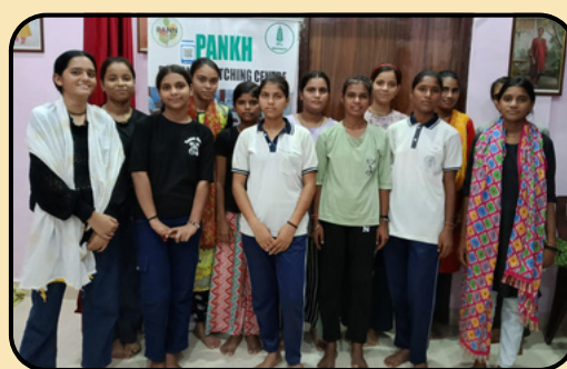
Glimpse of the menstrual hygiene awareness drives

These sessions created safe spaces for open dialogue, hands-on learning, and distribution of hygiene kits—reaching over 1,600 beneficiaries, including more than 600 schoolgirls. Girls were taught how to make their own sanitary pads using household materials, promoting self-reliance and affordability.