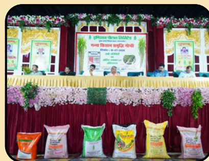
Glimpse of the programme

Field visits were conducted in Balhikhor, Bhamouri, and Bijapar villages to inspect crop health and guide farmers on disease management, proper sowing methods, and fertilizer application. On 18th July, a Kisan Sammelan was held at Avantika Marriage Hall, Siswa Bazar, attended by 150+ farmers. Farmers raised concerns on mill crushing capacity, fertilizer shortages, and machinery needs.